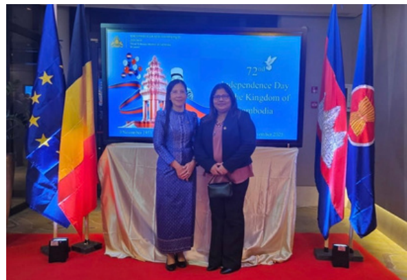
Ambassador Geela attends reception celebrating the 72 nd Independence Day of Cambodia 7 November 2025

Ambassador Geela attended the reception held in Brussels on the occasion of the 72nd Independence Day of the Kingdom of Cambodia.