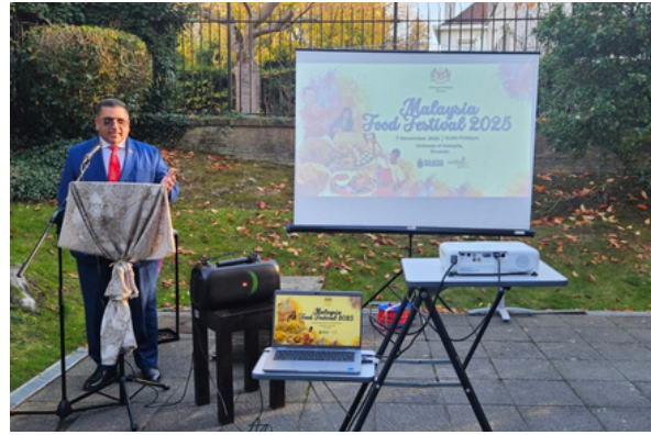
Ambassador Geela attends food festival held by the Embassy of Malaysia 7 November 2025

Ambassador Geela attended the Malaysian Food Festival hosted by the Embassy of Malaysia in Brussels.