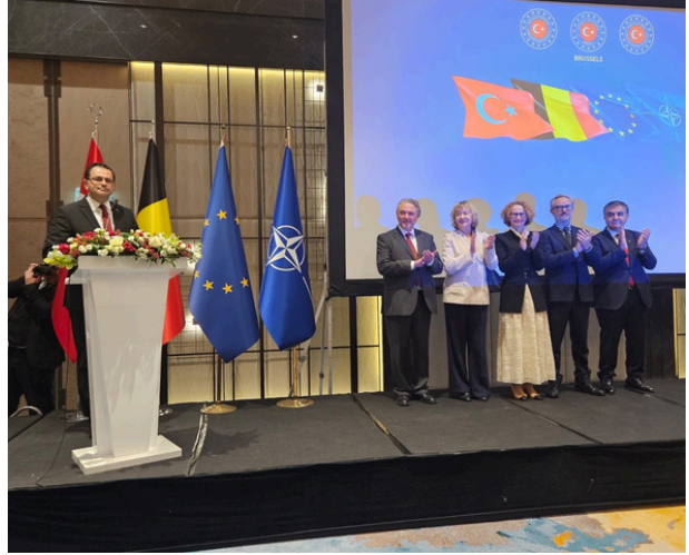
Ambassador Geela attends reception celebrating the 102nd Anniversary of the Proclamation of the Republic of Türkiye 29 October 2025

Ambassador Geela attends the reception held by the Embassy of Türkiye in Brussels, to celebrate the 102nd Anniversary of the Proclamation of the Republic of Türkiye.